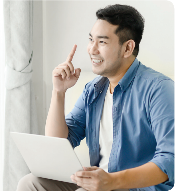
Our FREE tools can help you understand and manage your energy use.

Learn more about energy use and savings by visiting nyseg.com and click on Smart Energy.