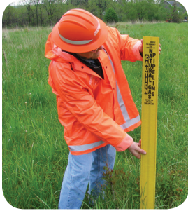
Line markers, such as the one above, indicate a buried natural gas pipeline's general location.

We work with industry groups to continually enhance natural gas pipeline safety. We also work with emergency responders, and state and local agencies, to prevent and prepare for emergencies through training and periodic drills.