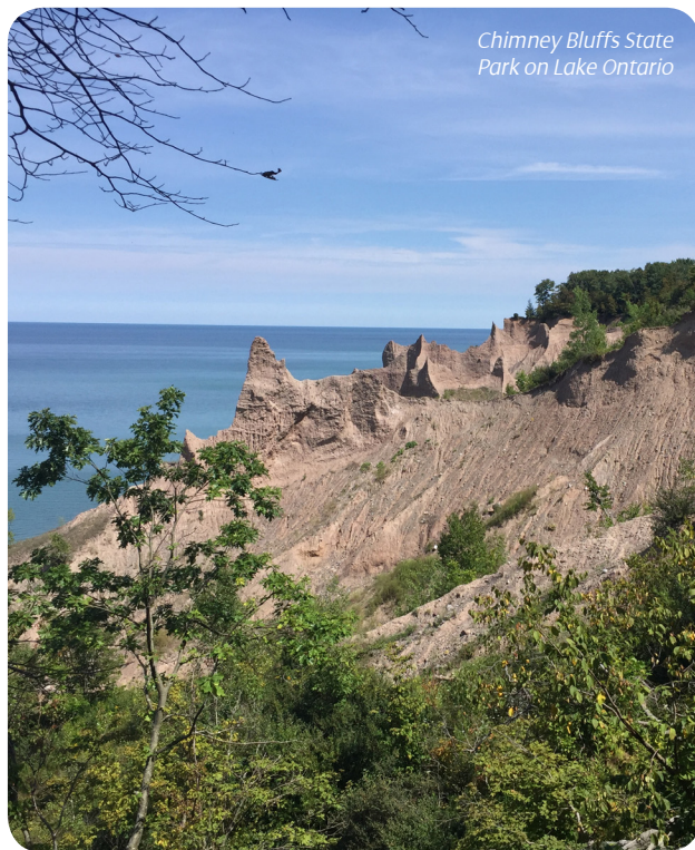
Chimney Bluffs State Park on Lake Ontario

For more information about our FREE payment options, please visit nyseg.com .