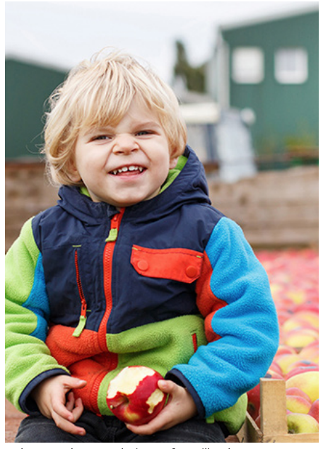
Help us reach our goal. Sign up for eBill today at nyseg.com.

Manage your account anytime, anywhere with our new Mobile App!