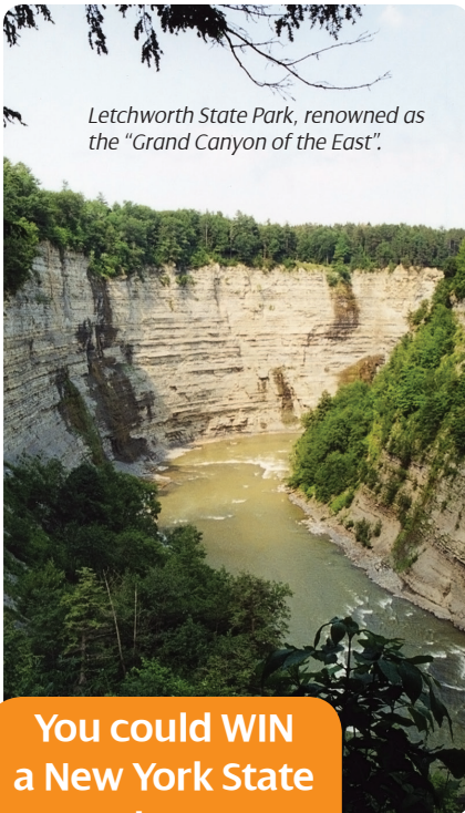
Letchworth State Park, renowned as the "Grand Canyon of the East".

Outage information when and how you need it. We're ready.