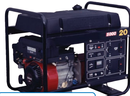
Typical portable generator