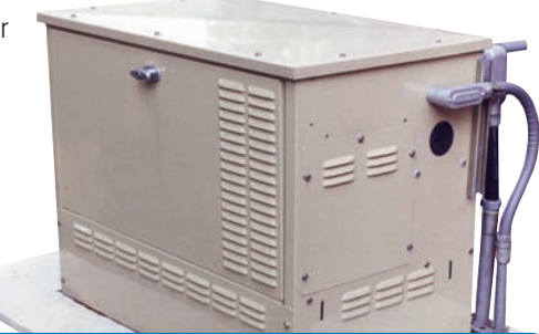
Typical stationary natural-gas fired generator

A Special Note About Natural Gas-Fired Generators >> Many generators fueled by natural gas require a delivery pressure that's greater than NYSEG's standard pressure. If the generator is not supplied with the manufacturer's suggested delivery pressure, it may not run. Before purchasing a natural gasfired generator, contact NYSEG at 1.800.572.1111 to ensure an elevated delivery pressure is available to your home or business. This is NOT available in all areas.