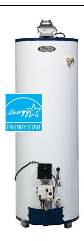
Energy Star Storage Natural Gas Water Heater ≥ 40 Gallons Qualifies for $100 Rebate